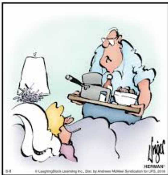
“Do you feel well enough to cook?”