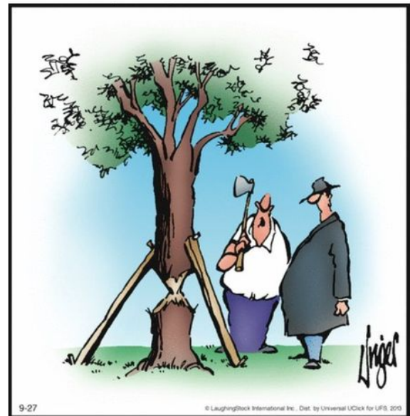
“She changed her mind.”