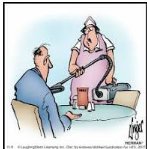
"D'you want a dessert or coffee?"