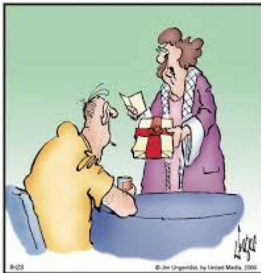
"Mother's sent you a coloring book for your birthday."