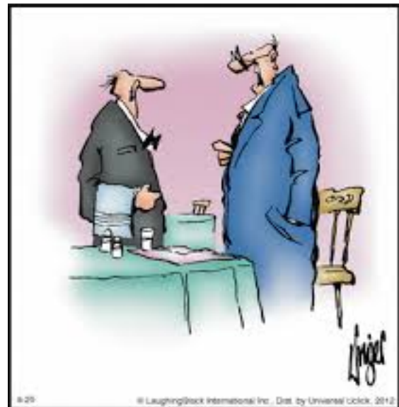
"If I was a tipper, you definitely wouldn't get one."