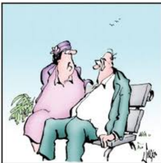
"I'd let you talk more, but you're not as interesting as me."