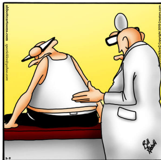
"You've finally achieved a V-shaped back. An inverted one."