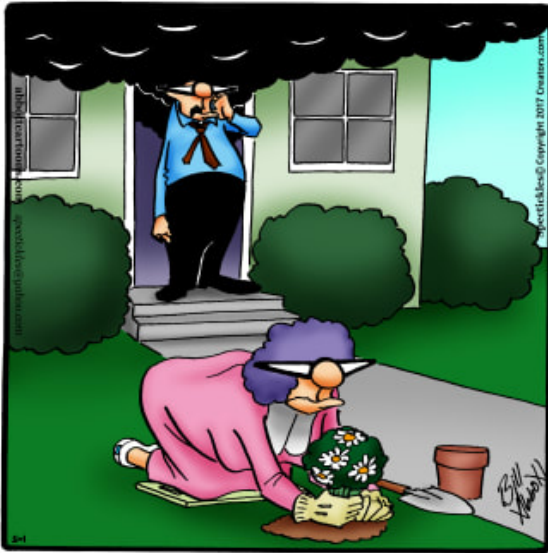
"How can I tell if the meat is done?"