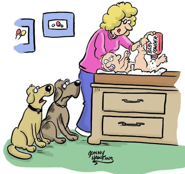
"He must be crawling with fleas."