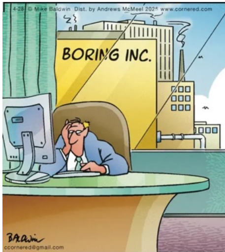
It was business as usual.