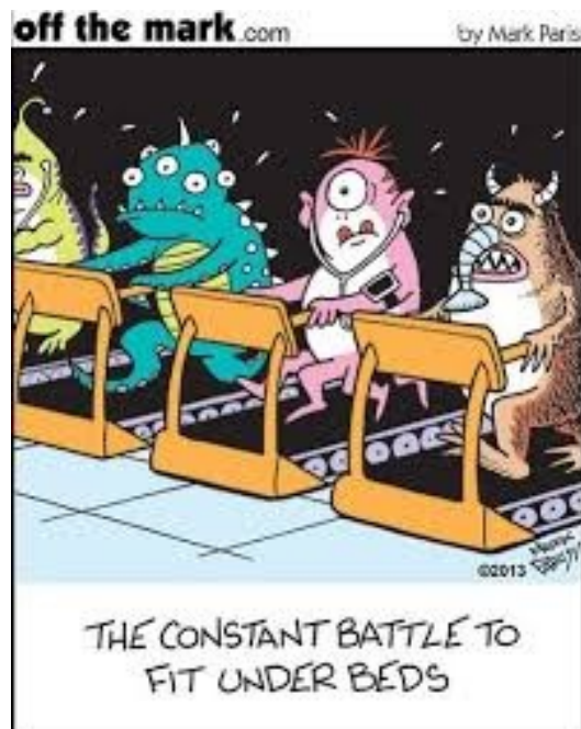
THE CONSTANT BATTLE TO FIT UNDER BEDS