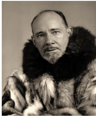
Sir Hubert Wilkins